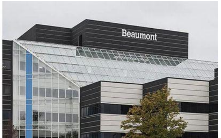
Spectrum Health/Beaumont Health

A new health system created by a merger between Spectrum, left, and Beaumont would be the state's largest employer.